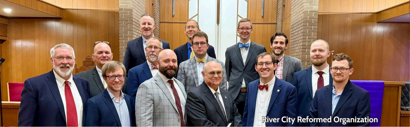
River City Reformed Organization