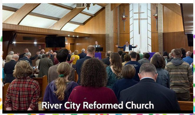
River City Reformed Church

To all: thank you for the resources and prayers that made these milestones possible. Your investment has yielded fruit that will impact generations. As you read these stories of renewal and growth, may you be encouraged by the reality that the Kingdom is expanding, one organized body at a time. Let us celebrate these three new sisters in our presbyteries and continue to pray for the missions still in the soil. 🌱