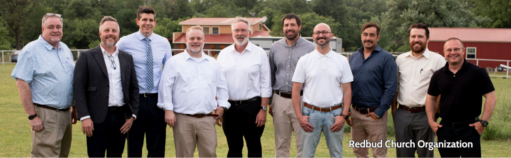
Redbud Church Organization